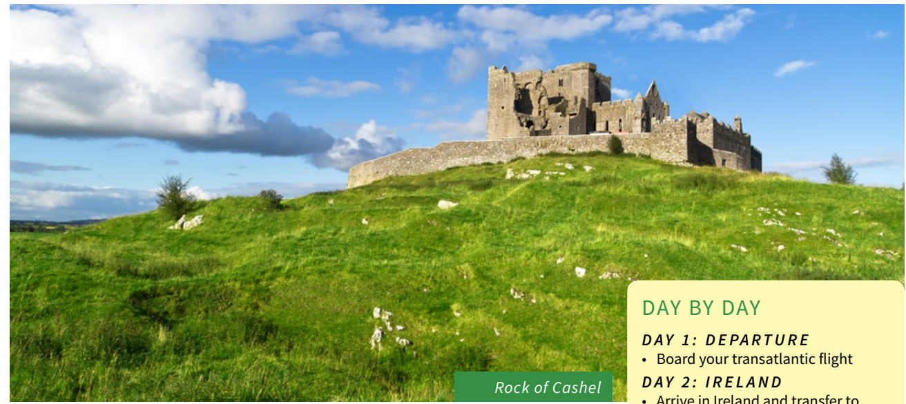
Rock of Cashel

Today you will depart for the small town of Cashel where you will pause to visit the unforgettable Rock of Cashel. The dramatic limestone rock crowned with secular and religious buildings dominates the flat countryside for miles around. Travel onwards to historic Kilkenny. In medieval times this was a prosperous trading center and even today the narrow streets still follow ancient routes. Visit Kilkenny Castle, built in the 13th century, home to the powerful Butler family for almost 600 years. Tonight you will enjoy a medieval-style banquet and entertainment in Bunratty Castle. The castle was built around 1425, and was the stronghold of the high